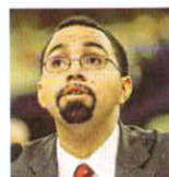
John King, commissioner of the state Education Department.